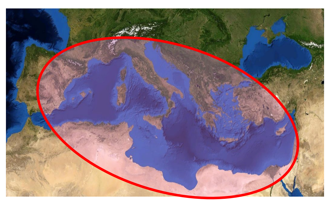
Algeria, Egypt, France, Greece, Israel, Italy, Malta, Morocco, Spain, Tunisia, Turkey

Pilot Action for a plastic-free, healthy Mediterranean Sea